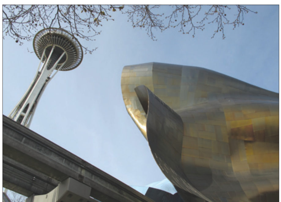
Seattle Space Needle towers above the Asian Art Museum in Capitol Hill's Volunteer

Given that Belltown is host to some of the region's finest culinary masters, we booked a tour with Seattle Food Tours to quench our thirst for local knowledge and walking tour includes a colourful, signed first editions.