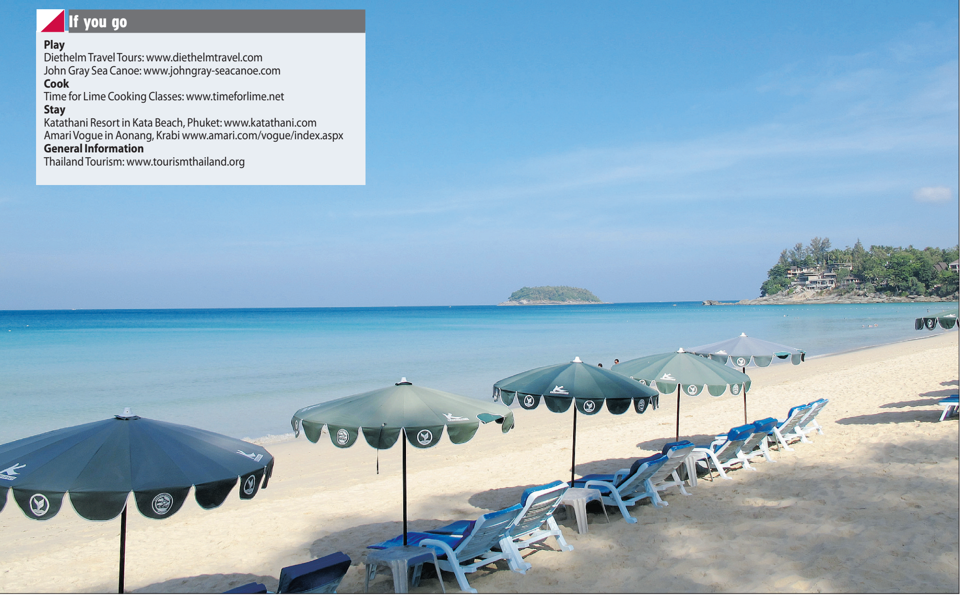
The beaches of Southern Thailand are among the most breathtaking in the world. Kata beach in particular is serene and stunning — perfect for lounging.