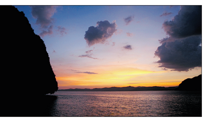
The real magic happens when the sun sets and you paddle in silence, under a blanket of stars, through the Hongs.