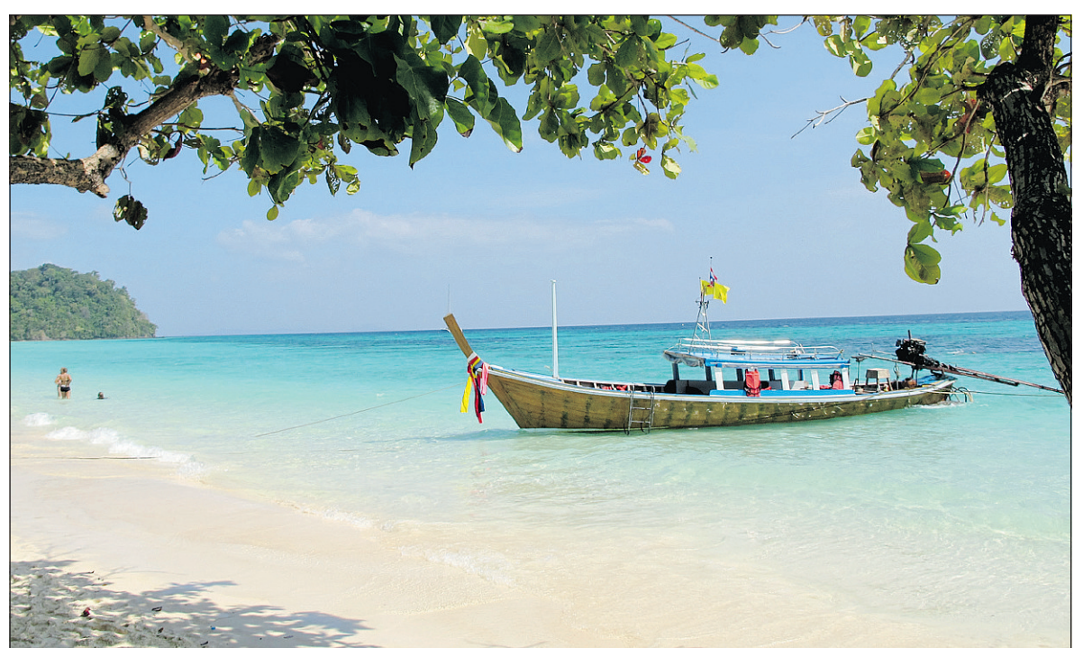
Ko Rok is known for its secluded and unspoiled white sand beaches and crystal clear waters; it's the ideal spot to soak up some sun.

There is no better way to experience Thai cuisine than rolling up your sleeves, donning an apron and hammering spices with a mortar and pestle. While Thai food has gained popularity throughout North America and made its way to the pour-and-stir world of grocers, absolutely nothing compares to the taste of traditionally-prepared curry chicken with freshly made chili paste. Taking a cooking class is one of our favourite ways to experience a destination, as there is so much to learn about a country's history through its cuisine. Thai food beautifully blends the Eastern and Western worlds. Stir frying cooking methods came from China, curries from India and the infamous Thai chili was introduced in the late 1600s by Portuguese missionar-