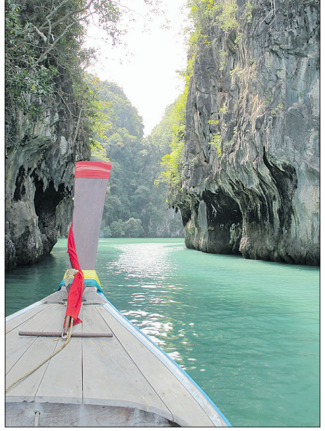
Each Hong is distinct with an ecosystem of jungle flora and fauna and wildlife.