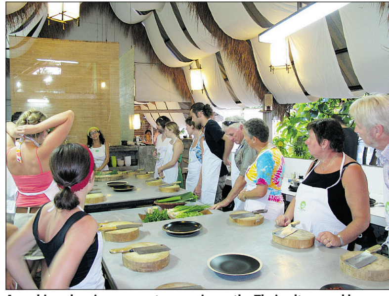
A cooking class is one way to experience the Thai culture and learn how to prepare authentic cuisine.

While it is sometimes difficult to trade an afternoon on the beloved beach chair for more taxing activities, Thailand's countless unspoiled national parks offer a pretty compelling reason to try. Our grand excursion, which took place north of Phuket in Khao Lak, started with a jungle hike to a secluded waterfall. After surviving the somewhat precarious trail, wearing highly inappropriate footwear and not an ounce of sunscreen, we floated down a peaceful stream aboard a bamboo raft and stared in awe at the tropical birds, hand-sized spiders and mildly-poisonous mangrove snakes resting in the treetops. Following a beachfront Thai lunch and swim in the sea, we got up close and personal with nature once again and 'boarded' an elephant to trek through the lush jungle and a rubber tree plantation. If you want to plan your tour in advance we recommend using internationally recognized Diethelm Travel as they provide exceptional service and are extremely professional.