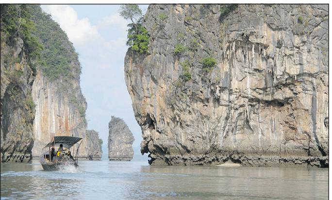
Gray's Seacanoe 'Starlight Hong Trip', is a once-in-a-lifetime adventure.