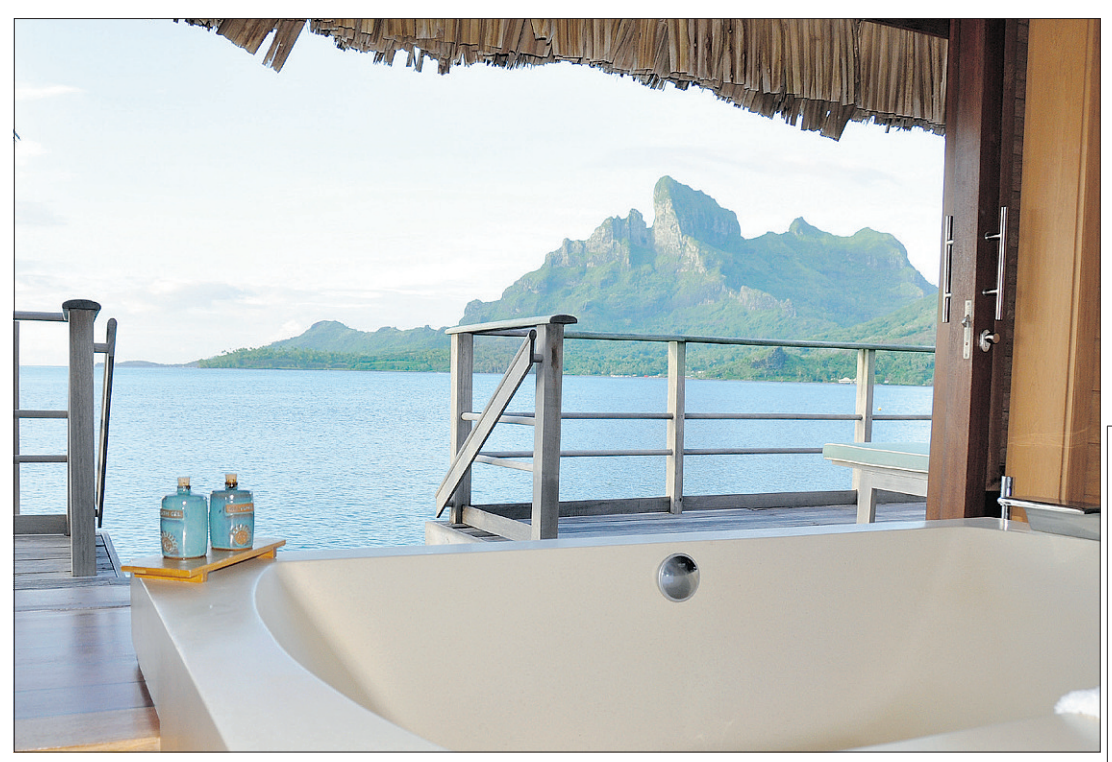
Four Seasons Bora Bora is one of the top hotels, with views of Mount Otemanu.