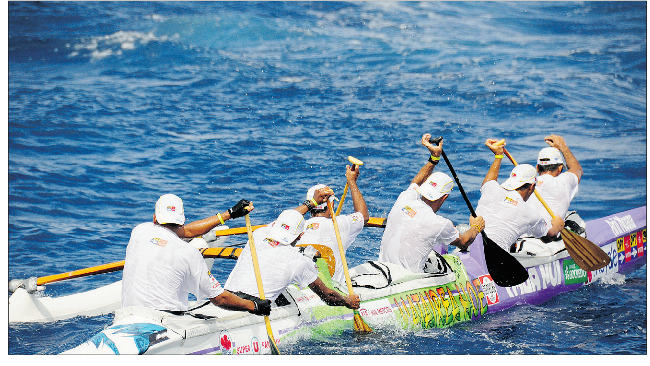
The Hawaiki Nui Va'a race is held over three days and racers paddle over 124 kilometres between the islands.

French, most Tahitians will happily A private island converse in English and even offer some simple phrases in the native Tahitian language.