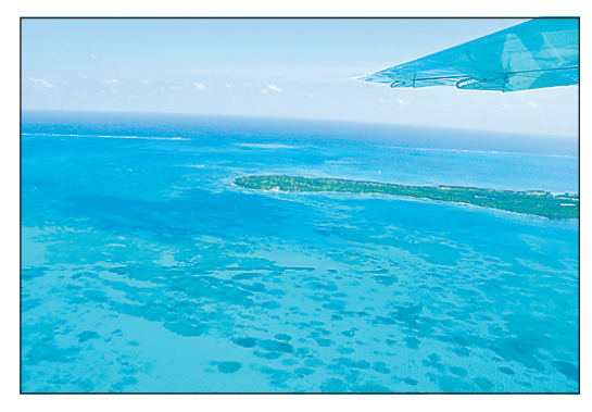
Belize is renowned for its stunning views of the Caribbean Sea.

Wanting variety, we spent our time exploring four unique areas but, for a more leisurely trip, limit yourself to one or two regions.