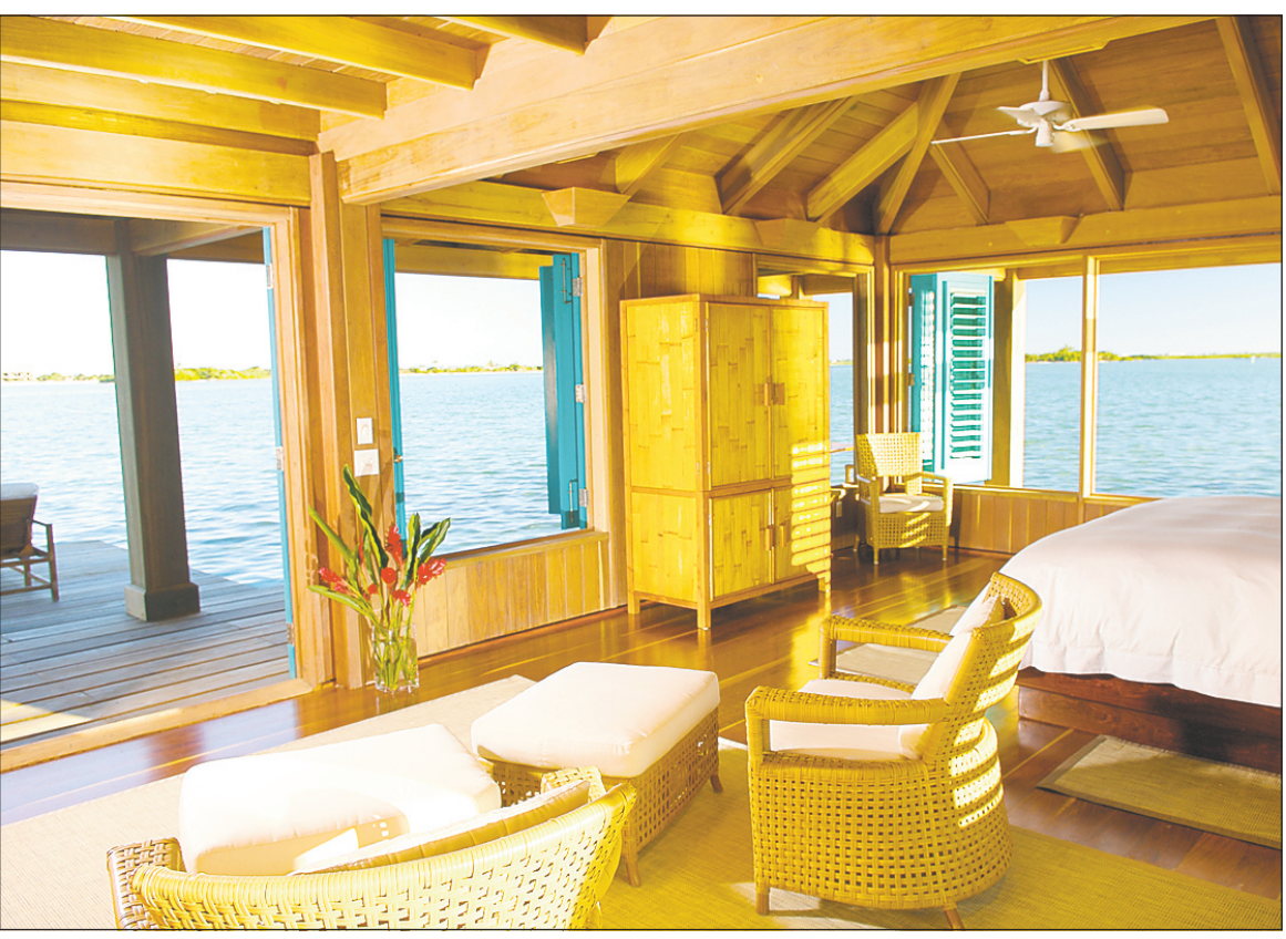
The Cayo Espanto is one of the region's most elite and private resorts, catering to only 16 guests at a time.