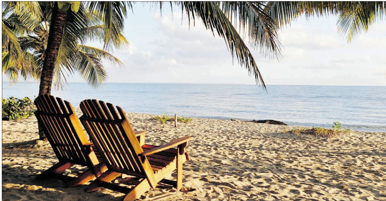
The soft, brand sugar sand at the Hamanasi Resort in Belize.

The San Ignacio Resort, overlooking its namesake town, is situated on a 17-acre estate along the Macal River. The family-run hotel, committed to the conservation of the threatened green iguana, created the Iguana Project 15 years ago to educate Belizeans