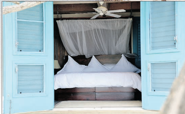
Luxurious accommodations next to the ocean at Cayo Espanto, Belize.