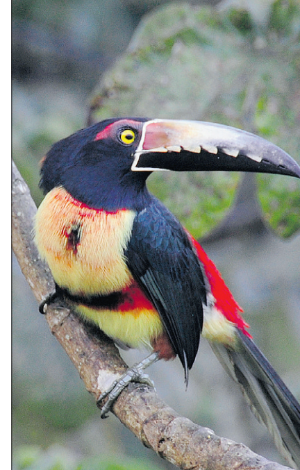
The Cayo Espanto is one of the region's most elite and private resorts, catering to only 16 guests at a time. Right: the toucan is native to Belize.

colourful village of Placencia, on the a burgeoning destination that thank-Southern peninsula of Belize's Staan Creek district. This once quiet fishing community has transformed itself into