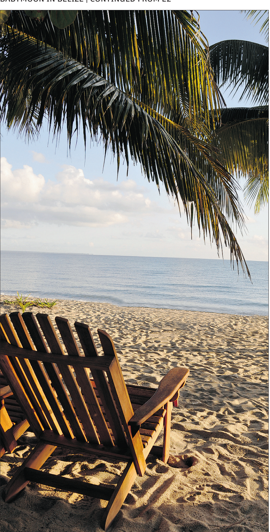
Belize offers beachside tranquillity as well as adventure.

Although the Hamanasi is renowned for its diving and adventure packages, which at six months pregnant I couldn't participate in, we happily spent our time walking the beach, exploring Hopkins, sunning ourselves poolside and visiting the neighbouring Butterflies Spa for couples massages and relaxation treatments.