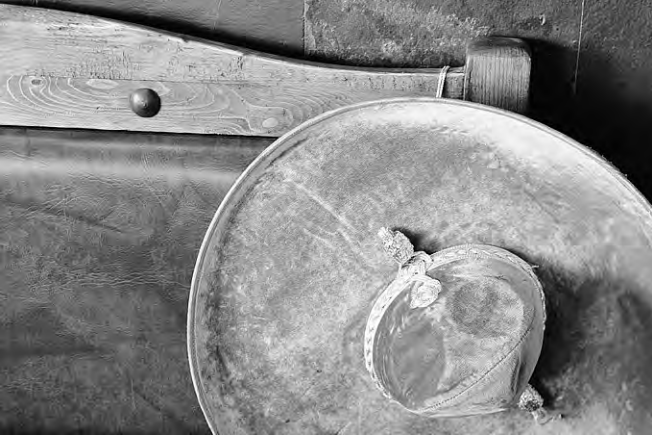
Tucson is bursting with southwest charm.

Prairie, Three Amigos and Tombstone. The on-site Story Museum speaks to the history of Old Tucson and displays some of the original costumes. Kids can pan for gold, ride a miniature antique car and take a spin on the carousel.