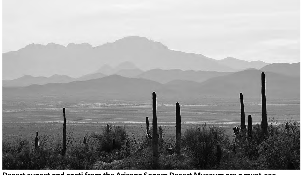
Desert sunset and cacti from the Arizona Sonora Desert Museum are a must-see.

With this in mind, I forged ahead with planning a weekend getaway to Tucson. Bursting with Southwest charm, Tucson offers a host of cultural, recreational and educational experiences, and has a fan-