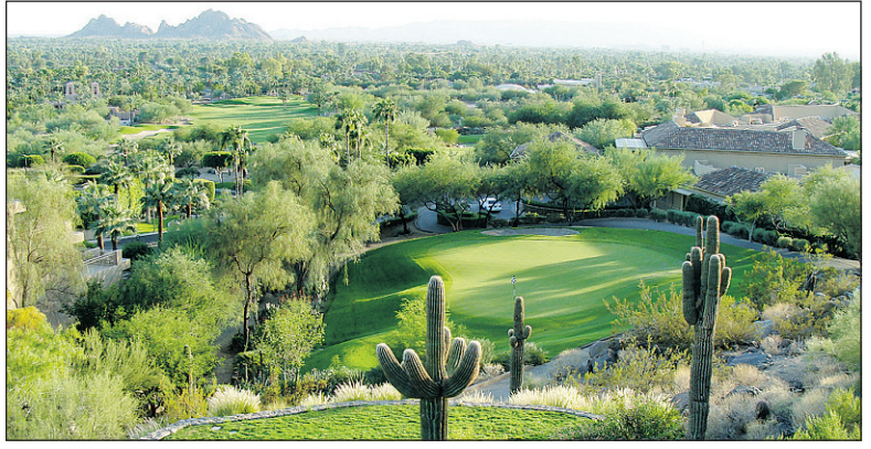
Lush manicured greens and an abundance of cacti welcome you to Phoenix.