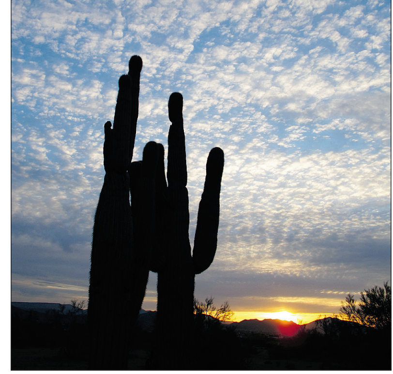
A breathtaking desert sunrise is perfect for a hot-air balloon ride.

Mhairri Cuthbert is a Vancouverbased travel writer at Arrivals.