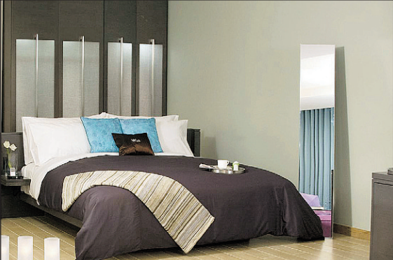
The W Hotel mixes chic with cheeky, with a party atmosphere to boot.